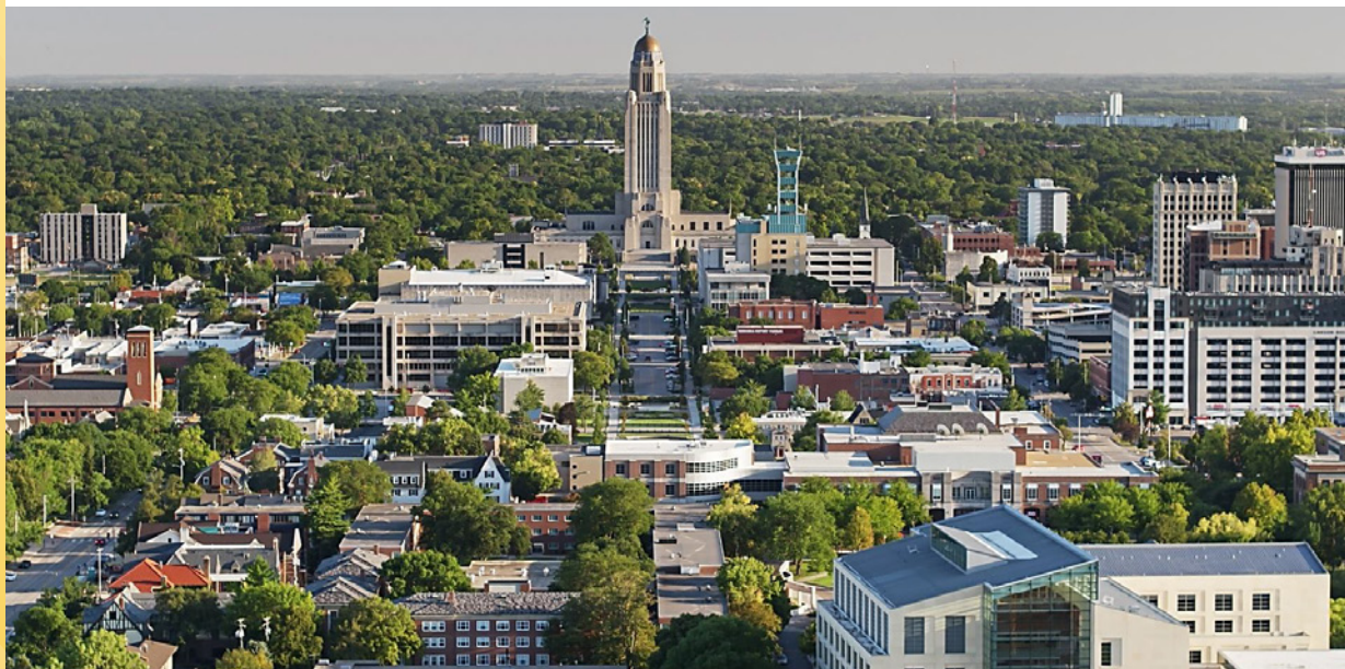
Dexter Schrod, JD